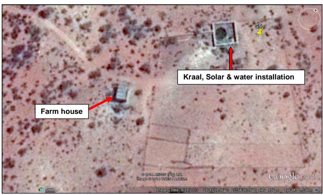
Map 5 Layout of the farm buildings at Point S9 on Sanddraai 391, Groblershoop.