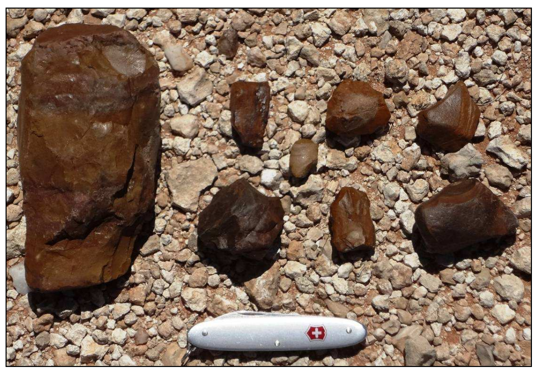
Fig.8 Stone cores at Point S4, Sanddraai 391 (Pocket knife = 84mm).