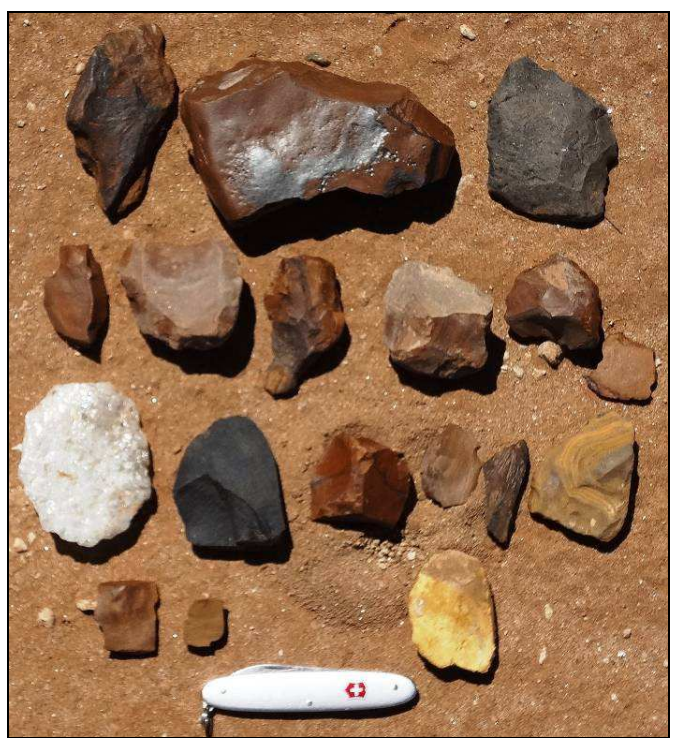
Stone flakes & cores at Point S2, Sanddraai 391 (Pocket knife =84mm). Fig.4