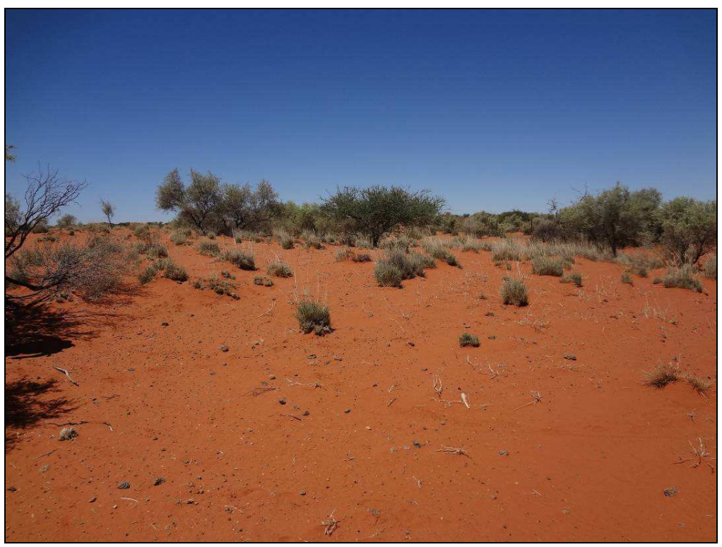
Fig.12 Point S8 at Sanddraai 391 near Groblershoop.