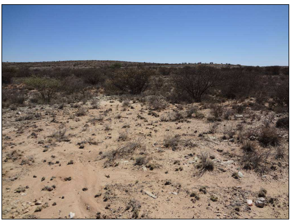
Point S2 at Sanddraai 391 near Groblershoop.