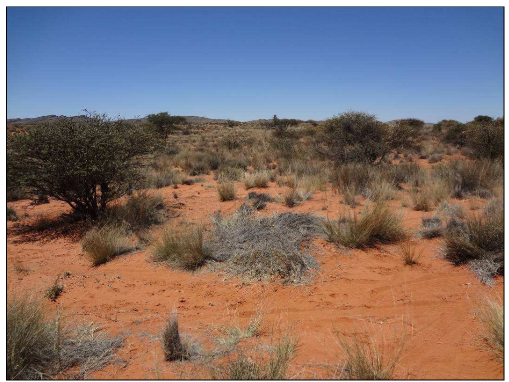
Fig.13 Point S9 at Sanddraai 391 near Groblershoop.