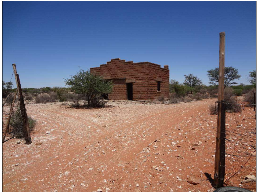
Fig.15 Farm house at Point S9, Sanddraai 391 near Groblershoop (See Map 5).