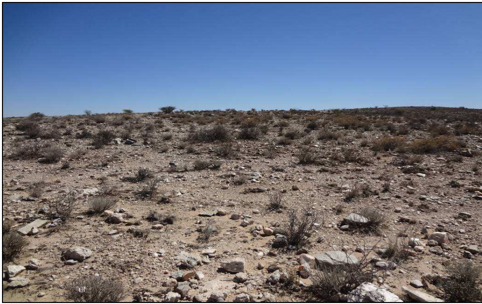
Fig.1 Point S1 at Sanddraai 391 near Groblershoop.