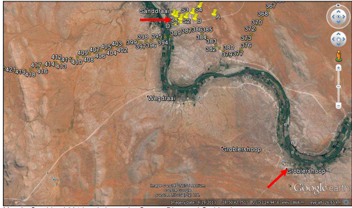
Map 2 Sanddraai 391 in relation to the Orange River and Groblershoop.