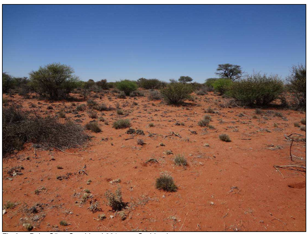
Fig.9 Point S5 at Sanddraai 391 near Groblershoop.