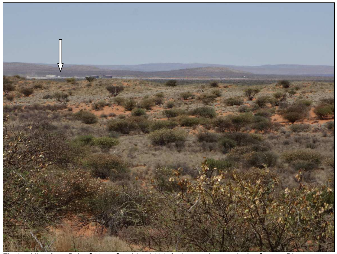
Fig.17 View from Point S10 on Sanddraai 391, facing south towards the Orange River. Bokpoort solar plant and the Garona Sub-station are visible on the left of picture.