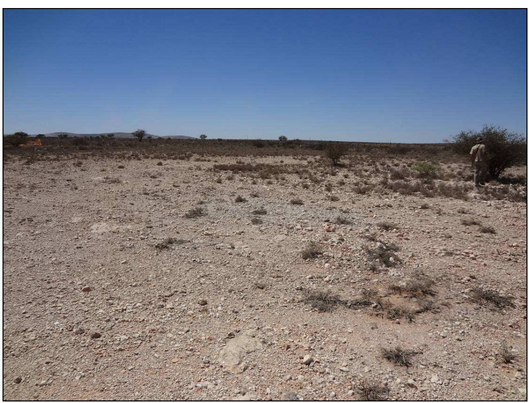
Fig.7 Calcrete spread at Point S4, Sanddraai 391 near Groblershoop.