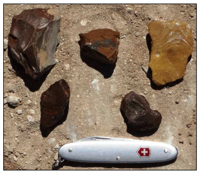
Fig.6 Stone flakes at Point S3, Sanddraai 391 (Pocket knife – 84mm).