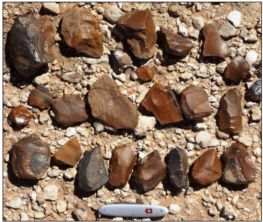
Fig.2 Stone flakes from Point S1 at Sanddraai 391 near Groblershoop (Pocket knife = 84mm).