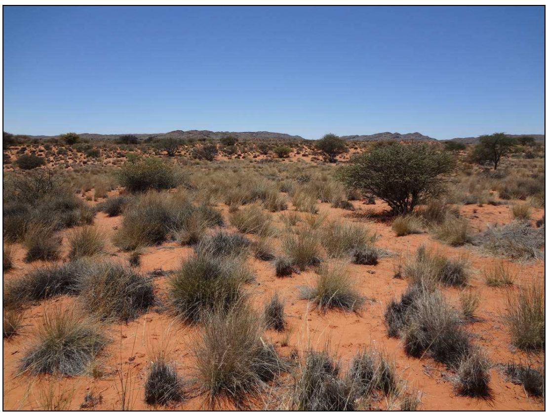
Fig.16 Point S10 on Sanddraai 391, Groblershoop.