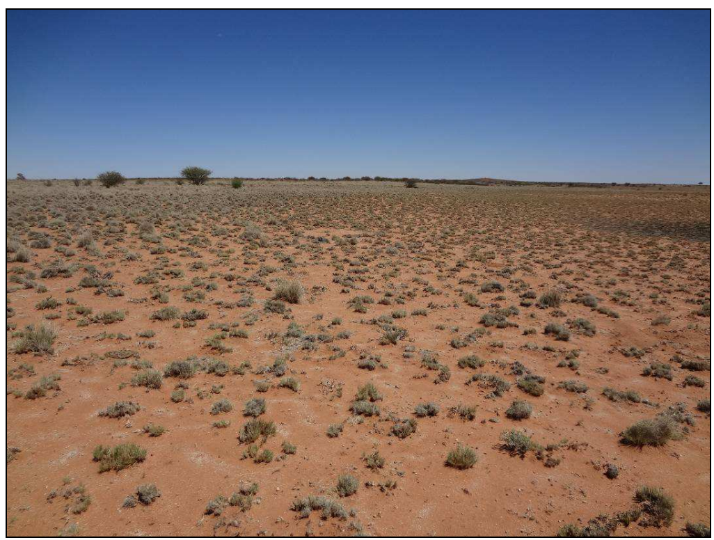
Fig.10 Point S6 at Sanddraai 391 near Groblershoop.