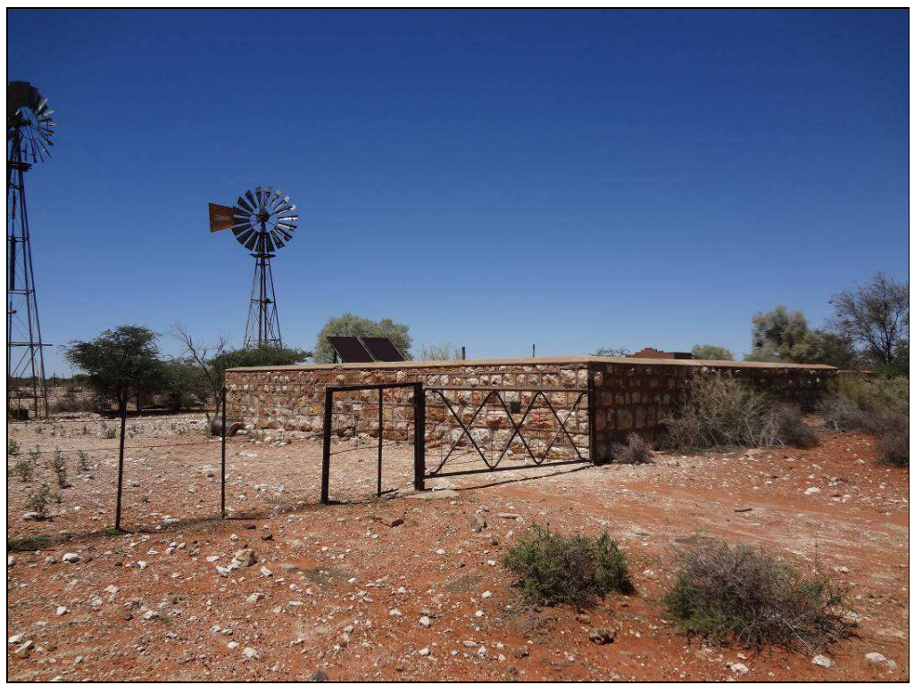
Fig.14 Stone kraal, solar panels & water installation at Point S9, Sanddraai 391.