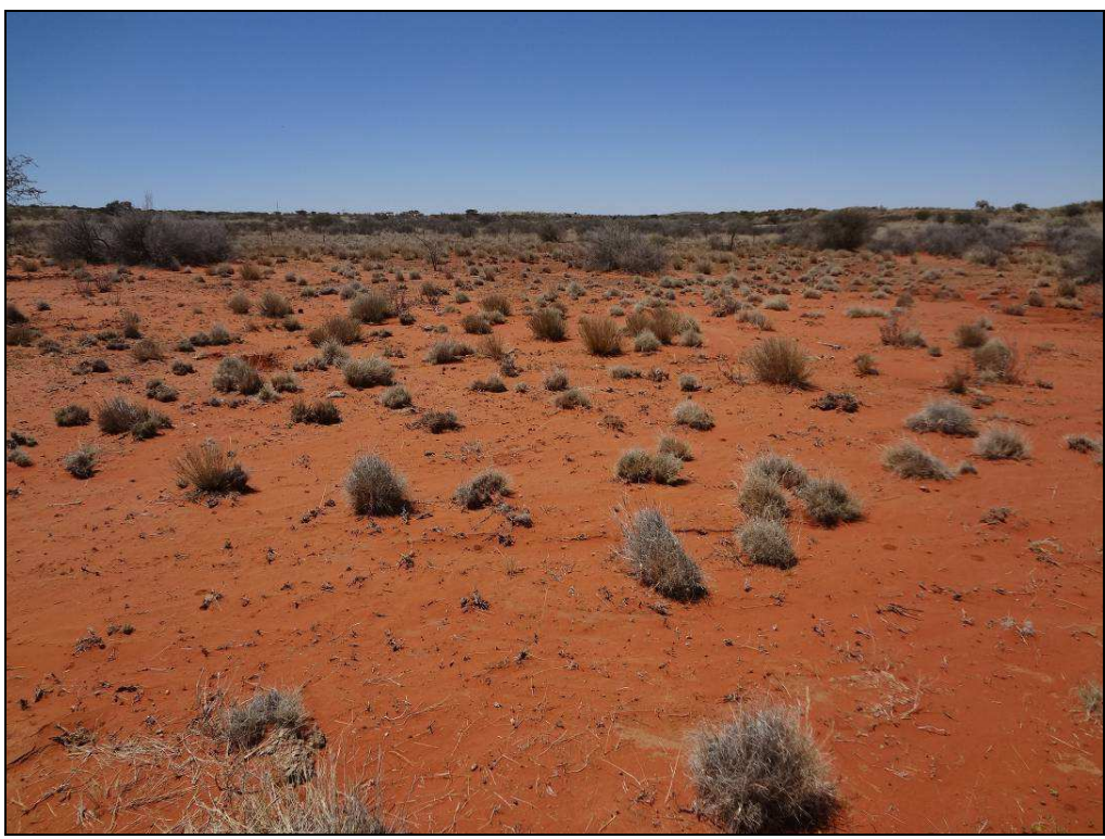
Fig. 11 Point S7 at Sanddraai 391 near Groblershoop.