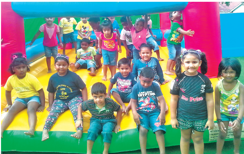
Little Darlings Educare held an Easter extravaganza on Tuesday March 31.