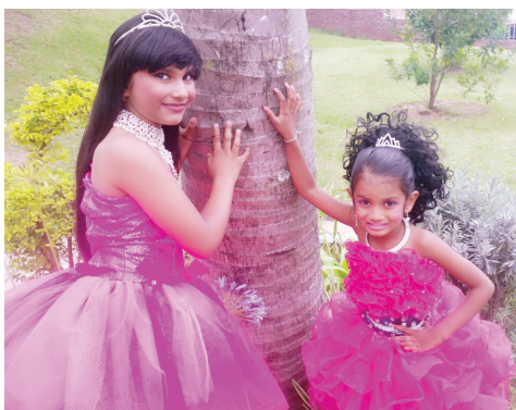
Early entrants in the Little Miss Barbie.

Ken, then this is just for you. World Class Events, for the first time in South Africa presents 'Barbie' and 'Ken.' Auditions are opened for finalists in the new Little Miss Barbie 2015 (ages three to 12) and Little Mr Ken 2015 (ages three to 12). It is a multiracial and multicultural production. Email your full contact details, physical address and a picture of yourself, your son, daughter or your niece to worldclassevents1@gmail.com . A reply with further de-