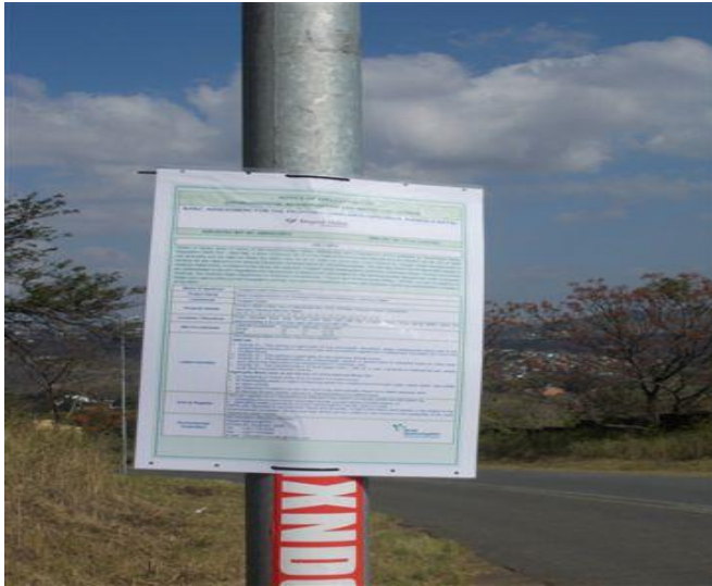
Plate 5: Site notice erected nearby the site in July 2015