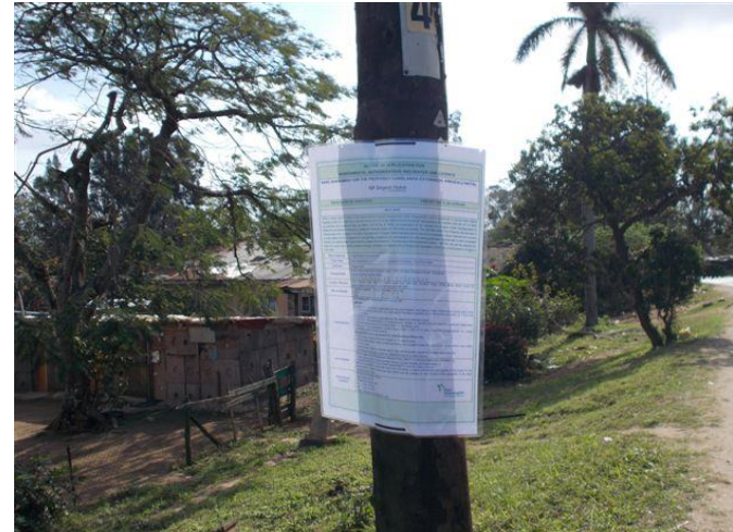
Plate 8: Site notice erected nearby the site in July 2015