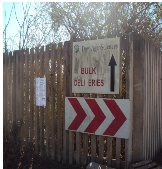
Plate 4: Site notice erected on Dow AgroSciences fence in August 2012