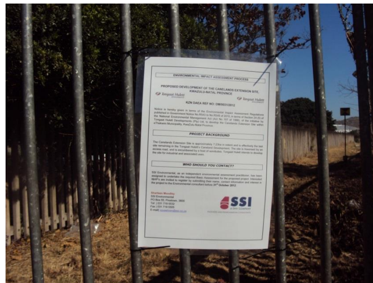
Plate 2: Site notice erected on site boundary in August 2012