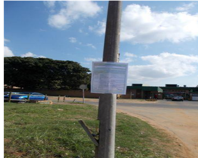
Plate 6: Site notice erected nearby the site in July 2015