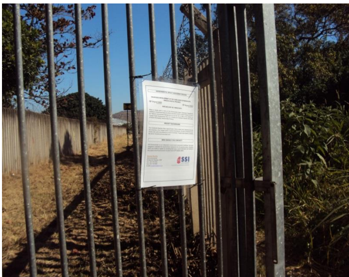
Plate 1: Site notice erected on site boundary in August 2012