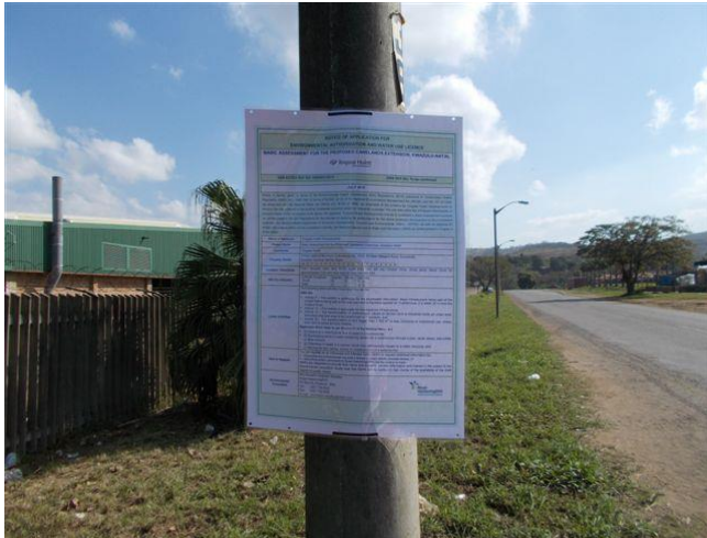
Plate 7: Site notice erected nearby the site in July 2015