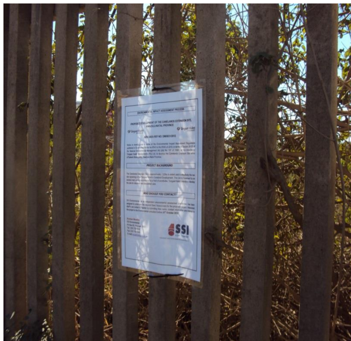
Plate 3: Site notice erected on Dow AgroSciences fence in August 2012