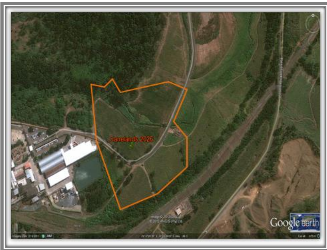
FIGURE 3 ANNOTATED GOOGLE EARTH IMAGE OF PROPOSED DEVELOPMENT SITE.