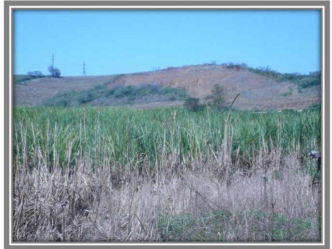
FIGURES 4-7 VIEWS OF THE PROPOSED DEVELOPMENT SITE.