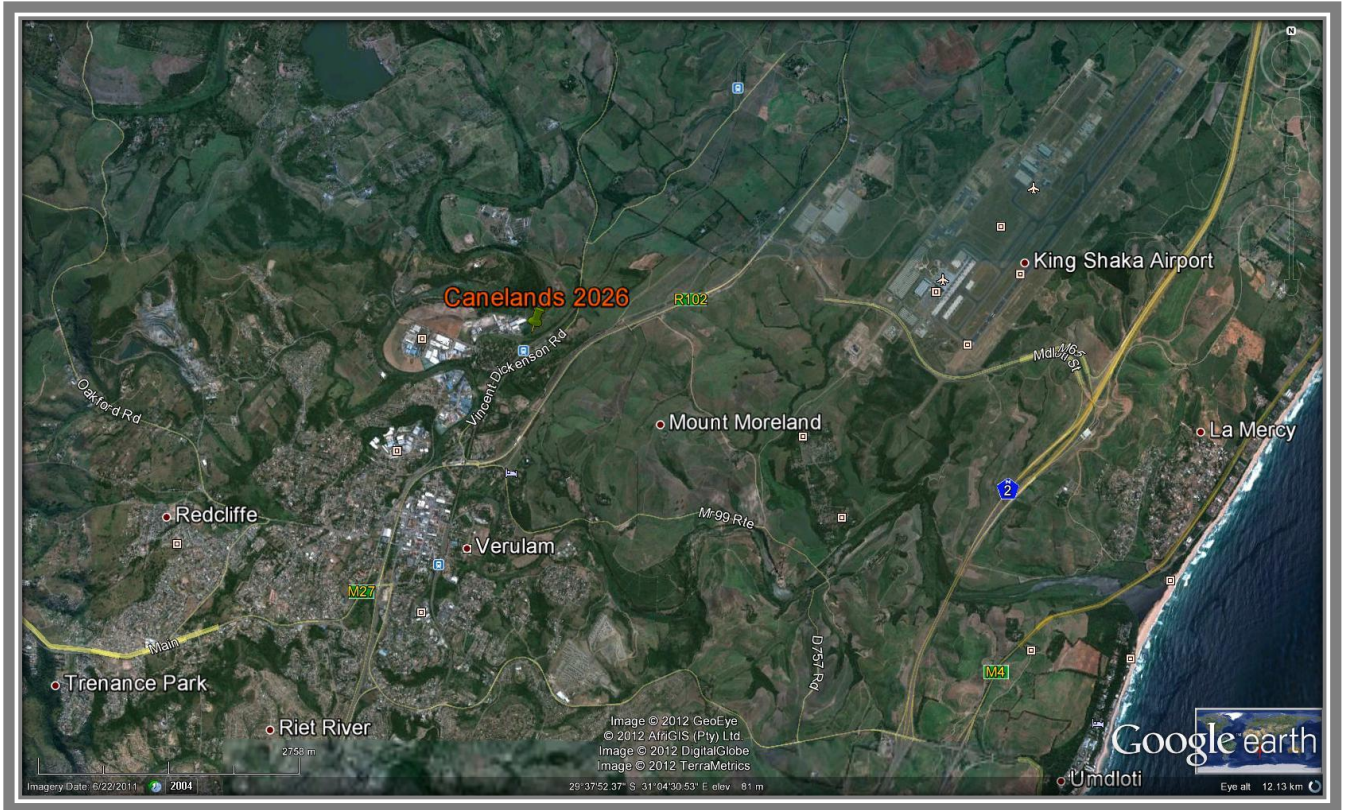
FIGURE 2 GOOGLE EARTH IMAGE OF PROPOSED DEVELOPMENT SITE IN REGIONAL CONTEXT.