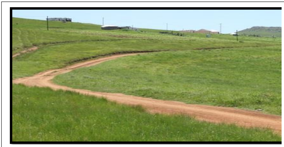
Figure 4. Present access road to the Bhudlu Bridge. The area is dominated by grasslands with some scattered homesteads.