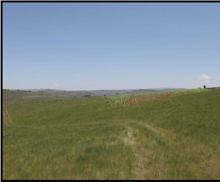
Figure 5. One of the present tracks in the area that will be investigated as a potential access road.