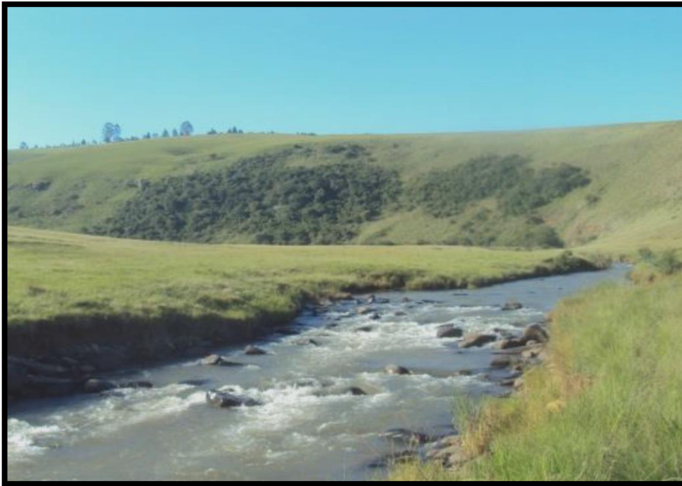
Figure 3. The proposed Bhudlu Bridge Site on the Umtavuna River